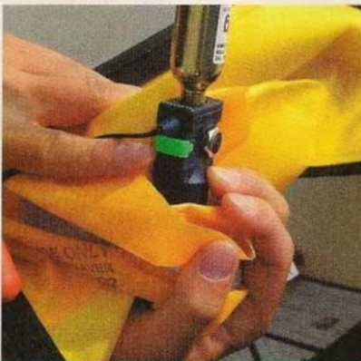
Check the plastic safety clip is intact

Remove the cylinder and check the operating head. Test the operation by pulling the lanyard and checking that the firing pin travels forward and returns freely and the pin is not worn or bent. Take care with the plastic safety clip, which is designed to break when operated, and may need to be replaced.