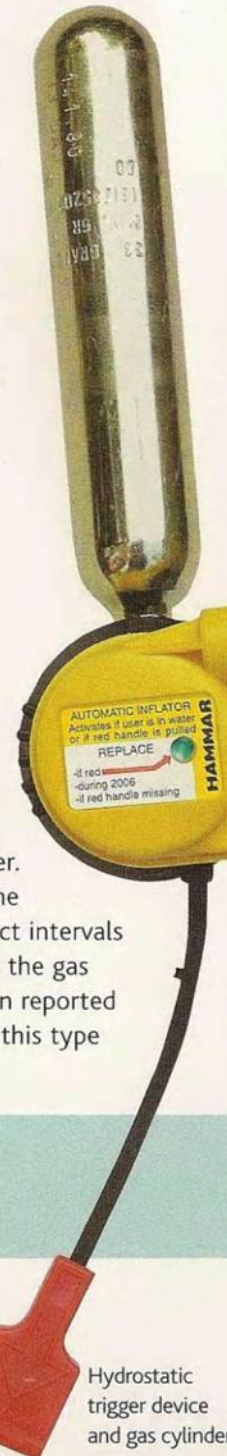
Hydrostatic trigger device and gas cylinder

Any part of the jacket that was in contact with a rusty cylinder should be checked for damage and may need to be repaired by the manufacturer. On lifejackets fitted with a hydrostatic trigger, the hydrostatic device must be replaced at the correct intervals and particular care must be taken to ensure that the gas cylinder is correctly tightened, as there have been reported instances of the cylinder becoming detached on this type of jacket.