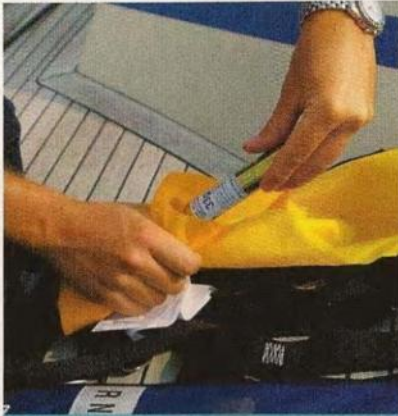
Ensure that the gas cylinder is correctly tightened

The CO 2 cylinder should be checked for corrosion and tightness at least every three months as these cylinders may become loose and fail to operate and corrosion may cause the cylinder to leak. A monthly tightness check and a 3 monthly bottle examination should be carried out.