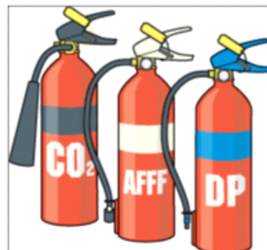
Three different types of fire extinguisher: CO 2 , AFFF Foam, and Dry Powder

It is messy but very effective at knocking down flames. It is suffocating when used in enclosed spaces.